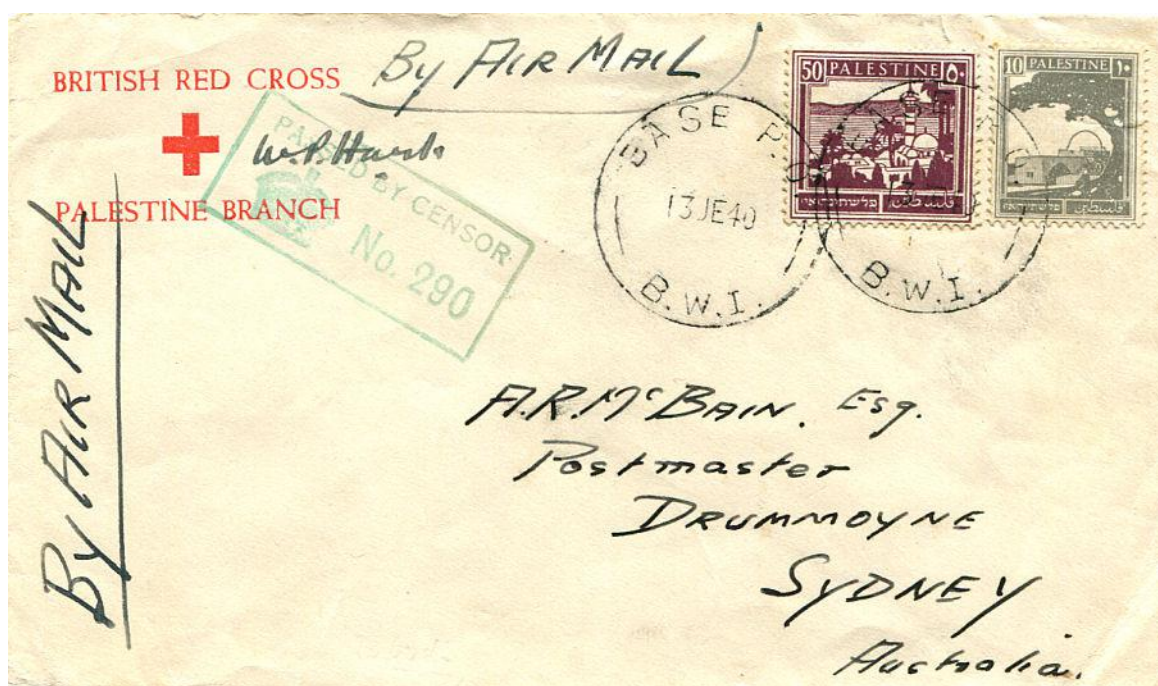
Figure 5.5: Postmarked in Palestine on 13 th June 1940, likely flown on NE 1 on 23 rd June.

The cover in Figure 5.5 is postmarked in Palestine on 13 th June. It was likely flown on NE 1 on 23 rd June.