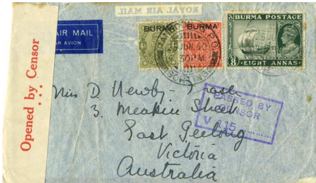
Figure 5.6: Postmarked in Rangoon on 25 th June 1940, flown on NE 1 on 26 th June.