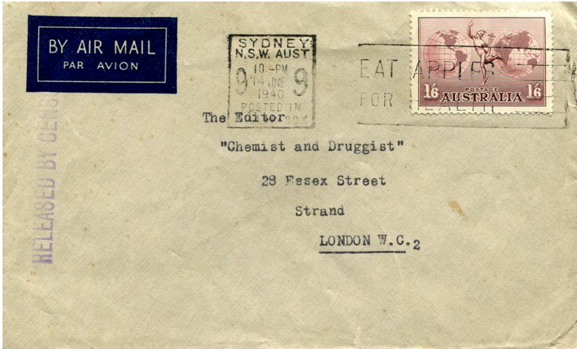
Figure 5.1: Airmail cover from Australia to London postmarked on 14 th June 1940. Flown on WS 1 .

An airmail cover postmarked in Sydney on 14 th June is shown in Figure 5.1 and was likely flown on WS 1 . An airmail cover from Palestine with a Field Post Office 121 postmark on 22 nd June and a Passed By Censor handstamp is shown in Figure 5.2. It was redirected in Edinburgh on 25 th July and so it must have been flown on WS 1 from either Tiberias or Cairo on 28 th June. Another cover from Palestine is shown in Figure 5.3 and is franked at the double rate of 120 mils.