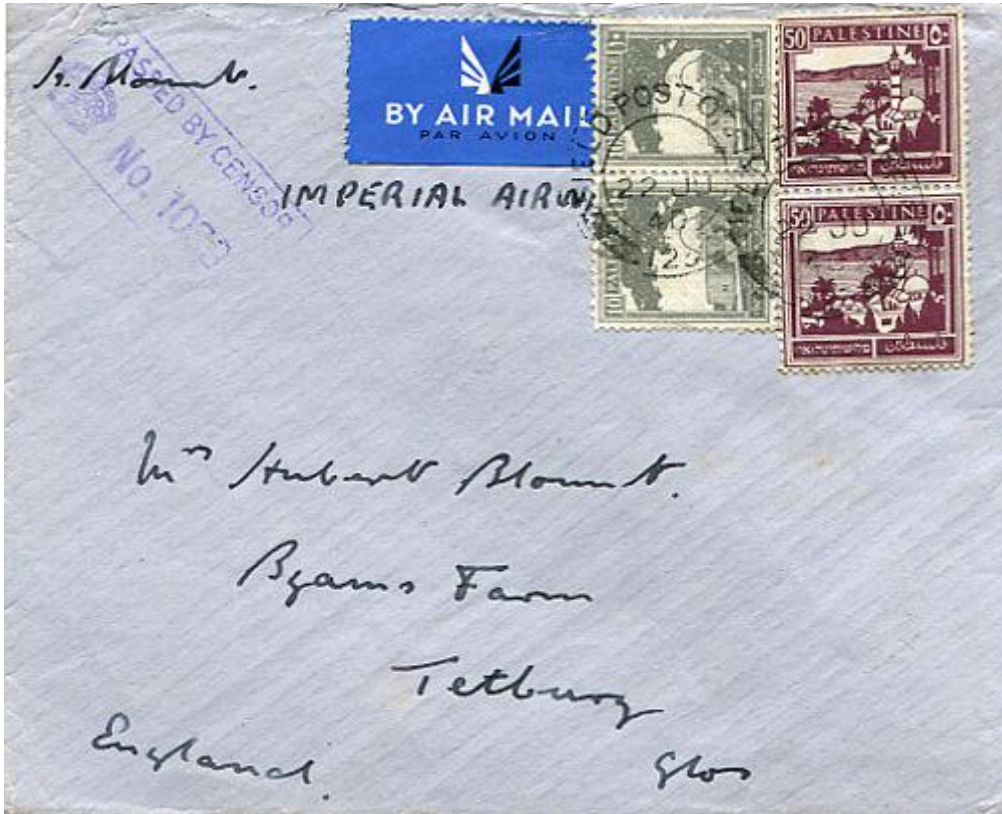
Figure 5.3: Airmail cover from Palestine postmarked on 22 nd June 1940 Franked at double rate of 120 mils. Flown on WS 1 .